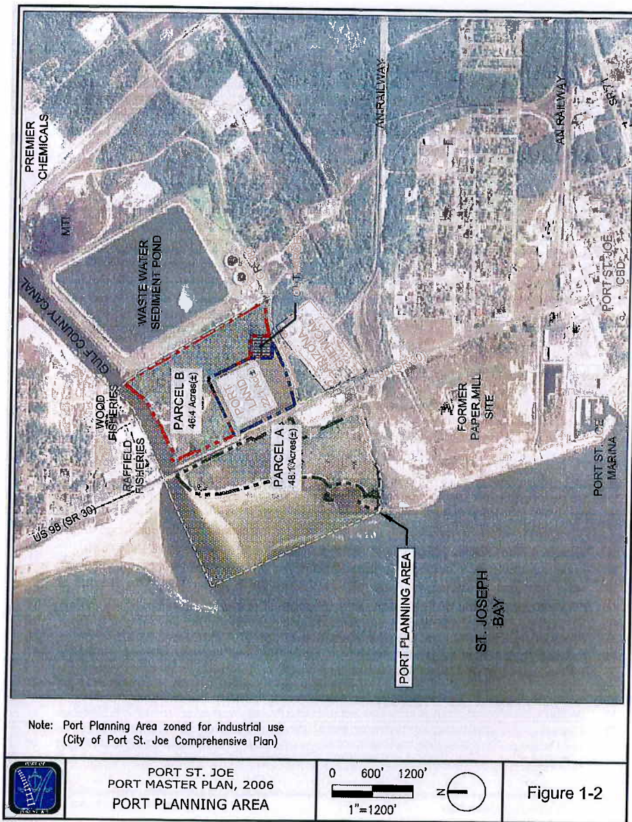
Exhibit 1. CURRENT PORT PLANNING AREA