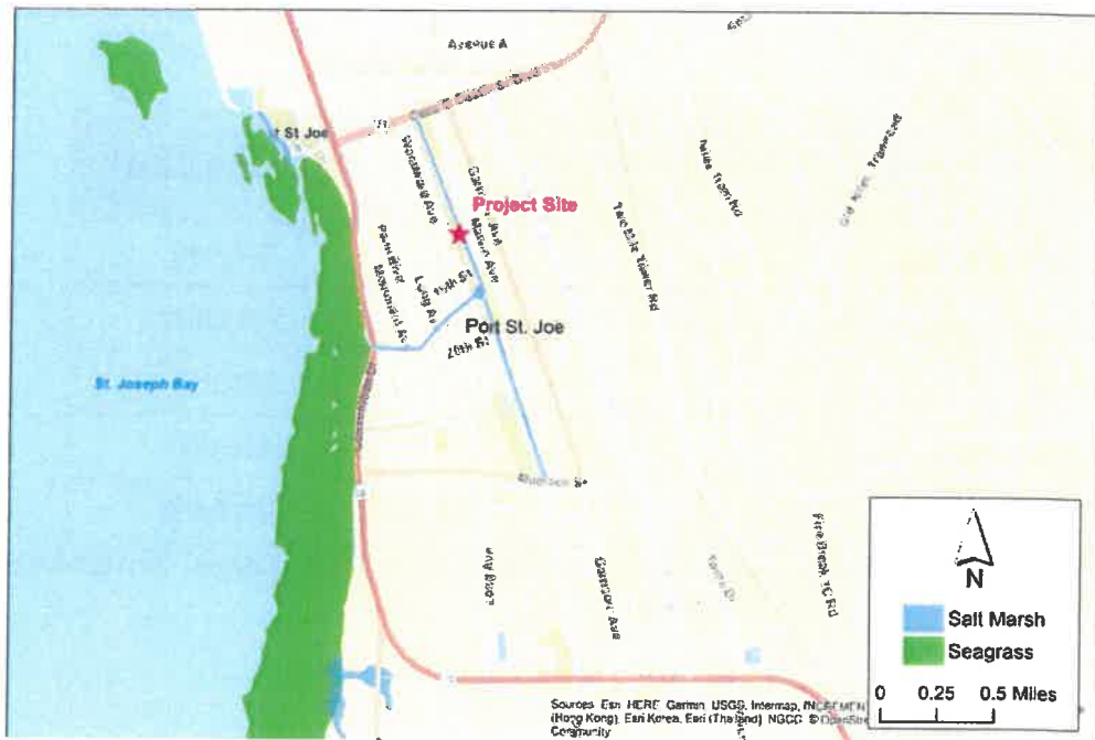
Figure 2. Port St. Joe Stormwater Improvements, Project Area